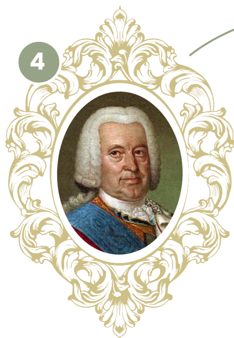
Ernst Johann von Biron (1690–1772)